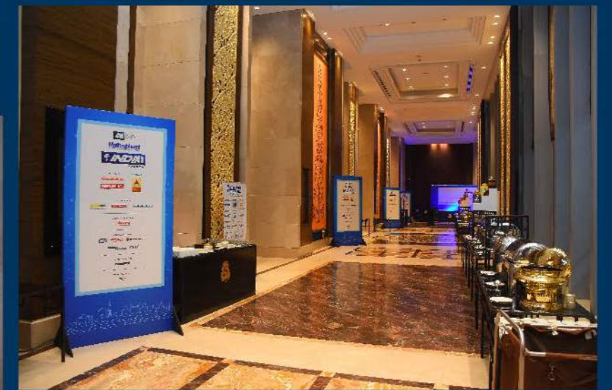
Standeers at the pre-function area