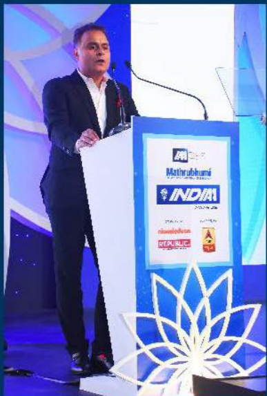
Branding on Podium