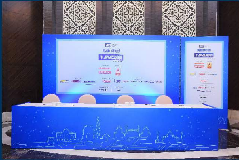
Branding at Registration Desk