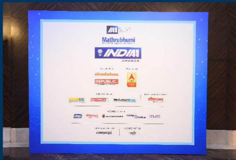
Branding on PR Wall