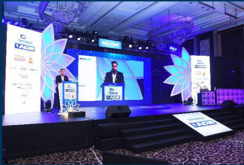
Branding on stage - Side Panels