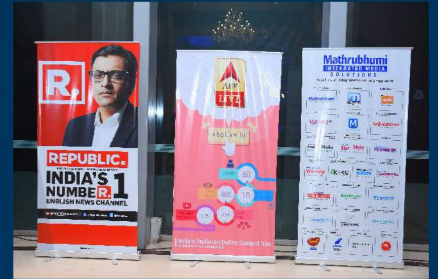
Standeers at the pre-function area